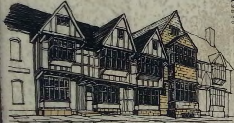
CLARENDON HOUSE , a fine 'Wealden' house of about 1470 extended by the building of Old Stone house in about 1630 and further extended in 1889.