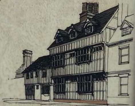
CROMWELL HOUSE , built as a prestigious town house for the prosperous head of a local family, allegedly in 1599.