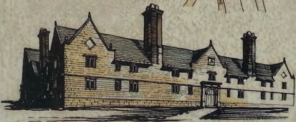
SACKVILLE COLLEGE , an almshouse founded by Robert Sackville, Earl of Dorset, in 1609 and still in residential use.