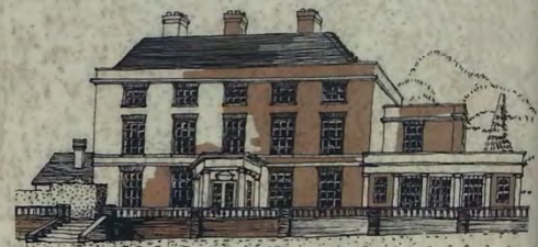
TO EAST COURT , a country gentleman's house of 1769, now in a public park and home to the Town Council and Town Museum.