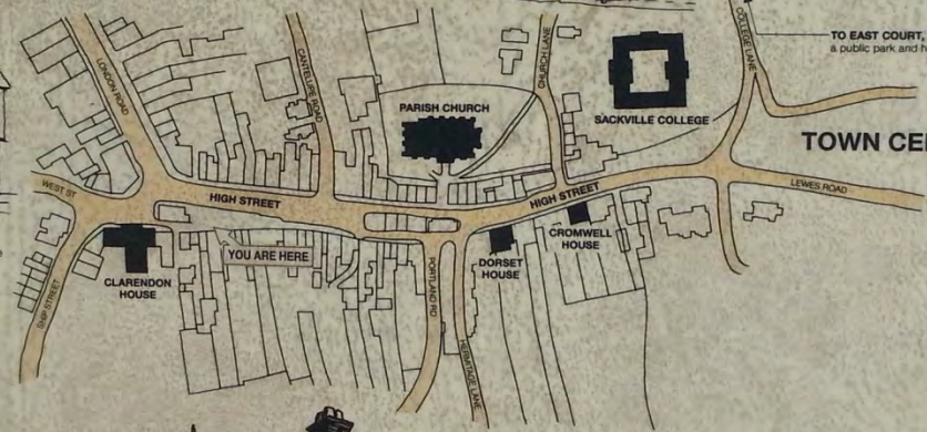
TOWN CENTRE PLAN